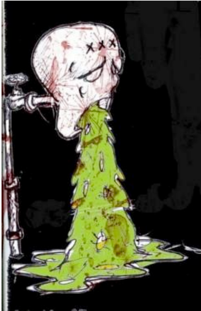
The raw energy of prison life.

So a prison is high in Free Child. It is primitive and brutal. It is also high energy, constant change and never dull. This is the quality that Free Child possesses that all other ego states don't that makes it central to the personality. In a prison there is manipulation, lies and deceit. But because of the high energy and Free Child it creates relationships that have a truth about them that is not usually found. There is in a sense an intimacy that is not found often in the outside world. The high energy puts the relationships on a different level, in one sense more true and with more realness. The social etiquette (bullshit) is non-existent. They see no reason to bother with it, and it is there where the realness comes out.